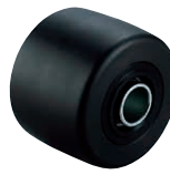
MCE MC nylon wheel (including B) (conductive)