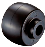
GNB Reinforced nylon wheel

* Allowable load indicates allowable load only for wheels.