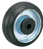
WP Steel plate wheel Rubber wheel