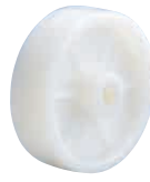
N Nylon wheel