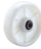
NB Nylon wheel (including B)