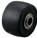
GFB Reinforced nylon wheel (including B)