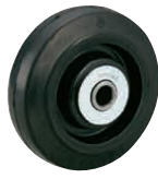
NR Rubber wheel with nylon wheel assembly (including B)