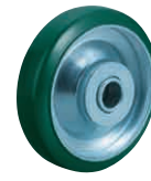
UW Urethane wheel with steel plate wheel assembly (including B)