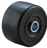
PB Phenol wheel (including B)

* Allowable load indicates allowable load only for wheels.