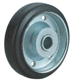
W Rubber wheel with steel plate wheel assembly (including B)