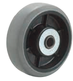
GU Urethane wheel with nylon wheel assembly (including B)