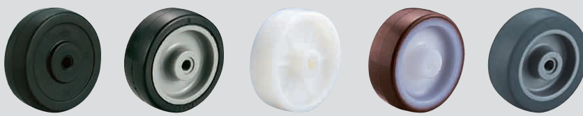
R RH Rubber wheel

Refer to P163 for detailed specifications.