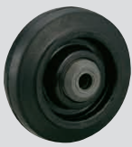
NR Rubber wheel with nylon wheel assembly (including B)

Refer to P162 for detailed specifications.