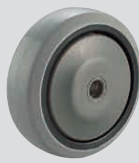
GU Urethane wheel with nylon wheel assembly (including B)