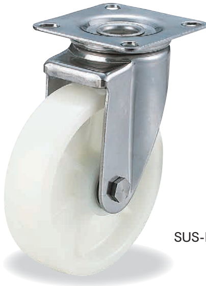
SUS-NJ 2 -150