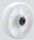
N Nylon wheel (including B)