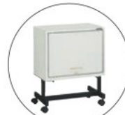
When the door is closed

Features •Can be neatly stored under a desk in compliance with old JIS standards (desk height: 740mm).