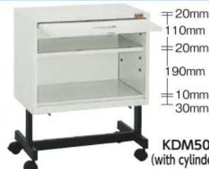
KDM50-2C (with cylinder lock)