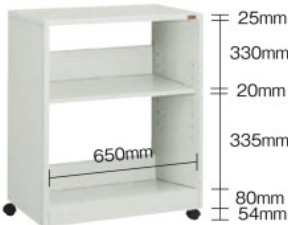
BF-700C (inclined shelf type)