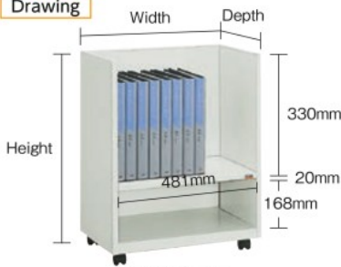
BS2A-T540C (files sold separately)

Specs Origin •Double wheel caster \phi 40mm: Flexible type with stopper x 2, Flexible type without stopper x 2 •Japan