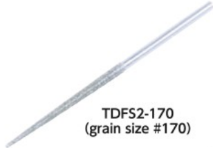
TDFS2-170 (grain size #170)