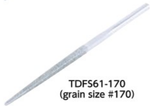
TDFS61-170 (grain size #170)