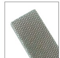
The file is pointed and sharp.