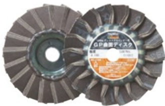
GP100R (alundum (for general metal))

ComEco Chemical Content Inspection Com Drawing SDS