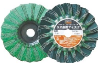
GP100RZ (zirconia (for heavy polishing))