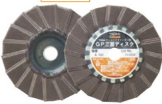
GP1003F: 180 (alundum (for general metal))

ComEco Chemical Content Inspection Com Drawing SDS