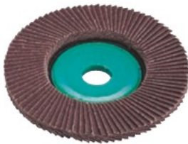
GP100DX (alundum (for general metal))