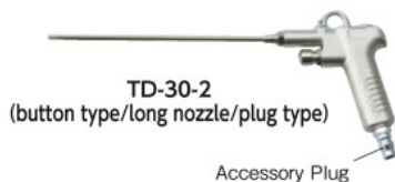
TD-30-2 (button type/long nozzle/plug type)