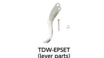
TDW-EPSET (lever parts)