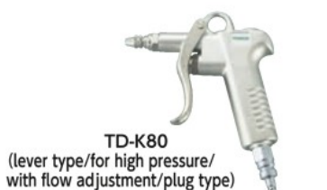
TD-K80 (lever type/for high pressure/with flow adjustment/plug type)

Contact us:0120-509-849 http://www.orange-book.com/