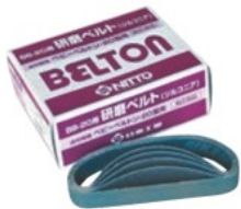
Abrasive Belt (zirconia)