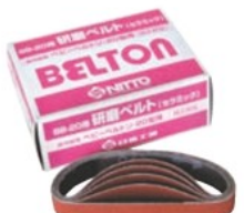
Abrasive Belt (ceramic)