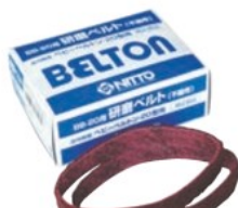
Abrasive Belt (non-woven fabric)