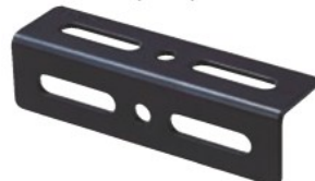
TK27-L4B (steel (black coating finishing))