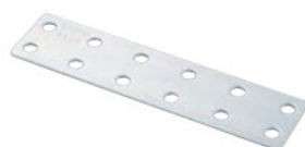
TKA-140S (stainless steel)