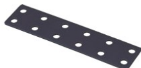
TKA-140B (steel (black coating finishing))