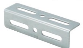
TK27-L4S (stainless steel)