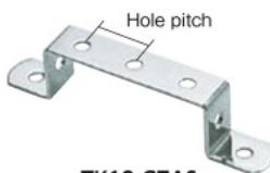
TK19-C7AS (stainless steel)