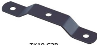
TK19-C3B (steel (black coating finishing))