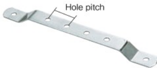
TK19-C6S (stainless steel)