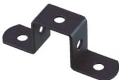
TK19-C5AB (steel (black coating finishing))