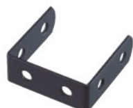
TK19-U6AB (steel (black coating finishing))