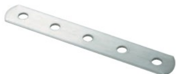
TK19-F5S (stainless steel)

Steel Materials • Steel • Surface Treatment: Chrome Plated Finishing