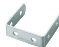
TK19-U6AS (stainless steel)

Steel Materials • Steel • Surface Treatment: Chrome Plated Finishing