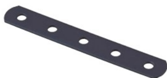
TK19-F5B (steel (black finishing))