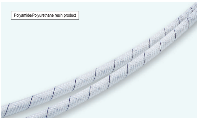
Polyamide/Polyurethane resin product