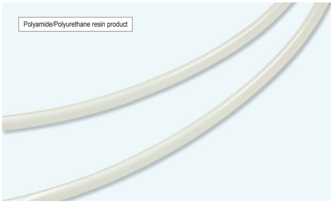
Polyamide/Polyurethane resin product