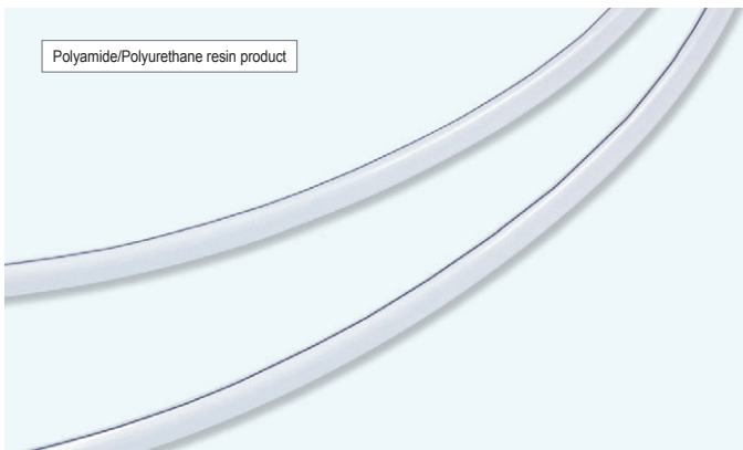
Polyamide/Polyurethane resin product