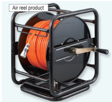
Air reel product