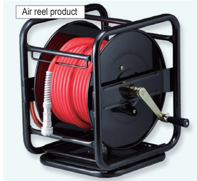
Air reel product