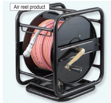
Air reel product