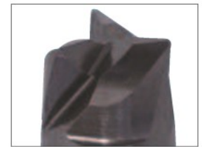
Cutting edge shape