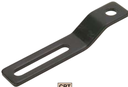
CRT (Crank Plate Tightener)