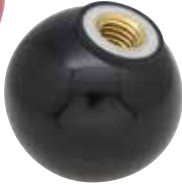
PC -B (With Insert, Black)