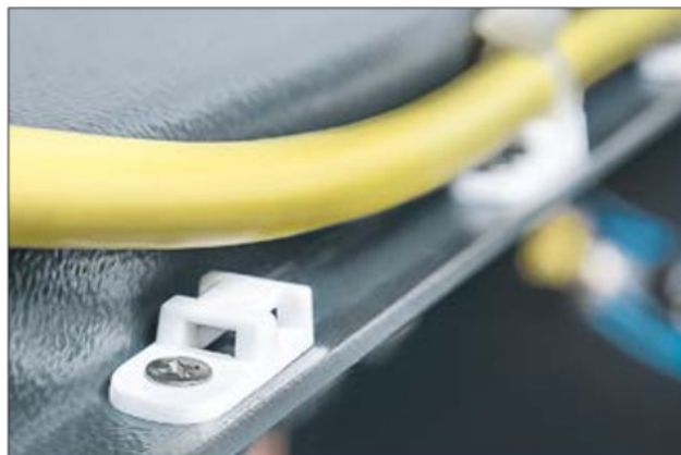
CTAM mounts for applications with limited space.