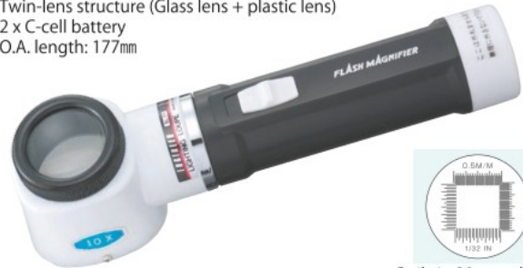
Built-in 20mm scale