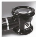
Intake of natural light for bright view